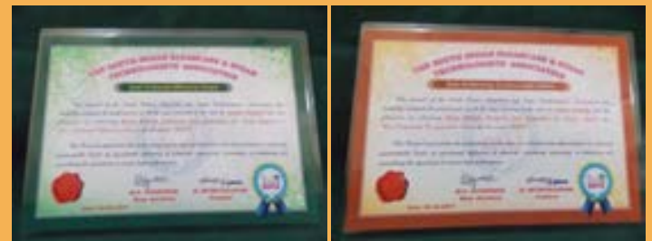
“Gold Award & Certificate”