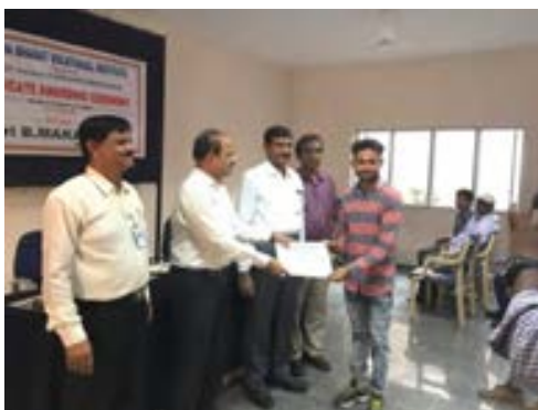
Certificate being awarded to a trainee of Welding Trade