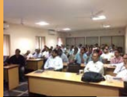
Workshop on “GST Implementation” at Paloncha