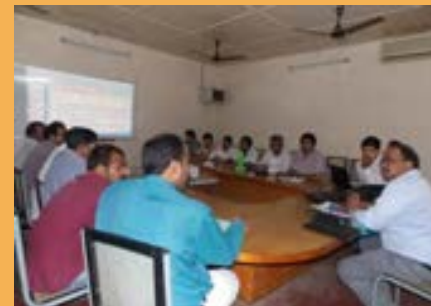
Programme on “Water Treatment Chemicals & Lubi make pumps” at Sugar Division