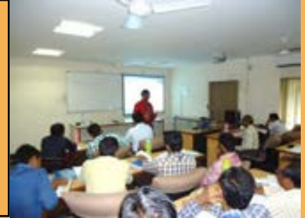
Awareness Programme on “IMS & Version 2015” in progress at Paloncha