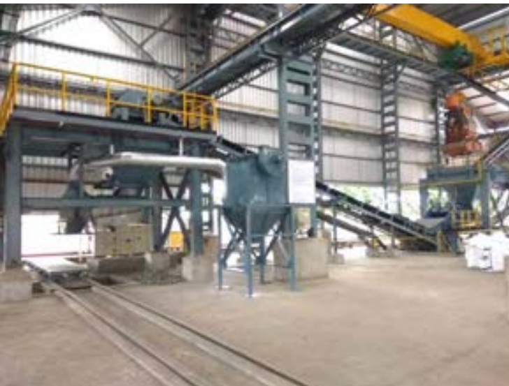
A view of the Mechanised Finished Product Packing Shed

The Management congratulates the staff of the Sugar Division for their achievements.