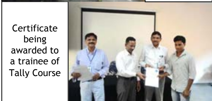
Certificate being awarded to a trainee of Tally Course