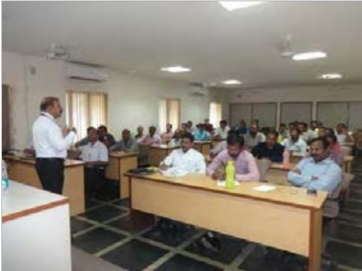
Training Programme on “Time Management” in Progress at Paloncha