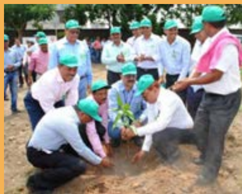
Plantation Programme at Odisha Works

The Company took up plantation of saplings along the approach road to Women Empowerment Centre at Paloncha and near Sewage Treatment Plant at Odisha Works.