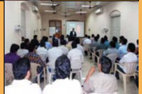
Programme on “Personal & Professional Effectiveness for Managerial Excellence” at Sugar Division